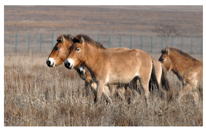
Fig. 3. Przewalski's horses at the breeding centre of the Association «Wild Nature of Steppe».

Optimal living conditions for horses, including satisfactory nutrition are evidenced by: good physical and physiological condition of animals, their behaviour, reproduction, absence of noticeable diseases and deaths in the herd. Every year new foals of Przewalski's horse are born at the Stationary. From 2013 to 2018, nine foals were born here. One of the four horses purchased from the Askania-Nova Reserve in 2013 proved to be pregnant, which means that on 20 October 2013 there were five horses, four adults and one foal. Since October 2013 another nine foals were born, which makes a total of 14 horses in 2018. In 2018, a harem of 11 specimens was kept in the large enclosure, and three males were kept in an isolated pen of 0.3 km<sup>2</sup>. The growing number of Przewalski's horse in the Association «Wild Nature of Steppe» in 2013–2018 is shown in Fig. 4.