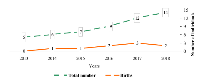
Fig. 4. Dynamics of Equus ferus przewalskii numbers at the breeding centre of the Association «Wild Nature of Steppe» Stationary in 2013–2018.

Optimal living conditions for horses, including satisfactory nutrition are evidenced by: good physical and physiological condition of animals, their behaviour, reproduction, absence of noticeable diseases and deaths in the herd. Every year new foals of Przewalski's horse are born at the Stationary. From 2013 to 2018, nine foals were born here. One of the four horses purchased from the Askania-Nova Reserve in 2013 proved to be pregnant, which means that on 20 October 2013 there were five horses, four adults and one foal. Since October 2013 another nine foals were born, which makes a total of 14 horses in 2018. In 2018, a harem of 11 specimens was kept in the large enclosure, and three males were kept in an isolated pen of 0.3 km<sup>2</sup>. The growing number of Przewalski's horse in the Association «Wild Nature of Steppe» in 2013–2018 is shown in Fig. 4.