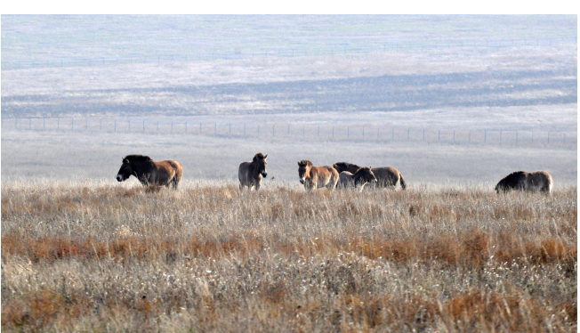
Fig. 2. The harem of Przewalski's horses at the breeding centre of the Association «Wild Nature of Steppe».